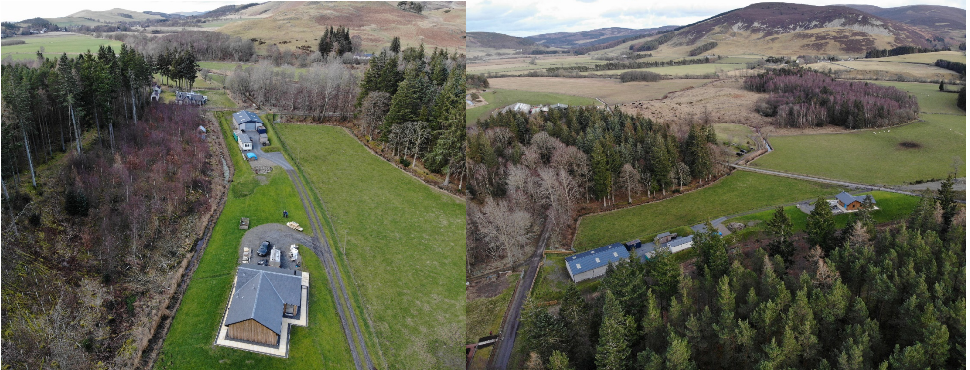
Fig 4: Aerial photographs of the proposal site within the setting of the Rachan dispersed building group.