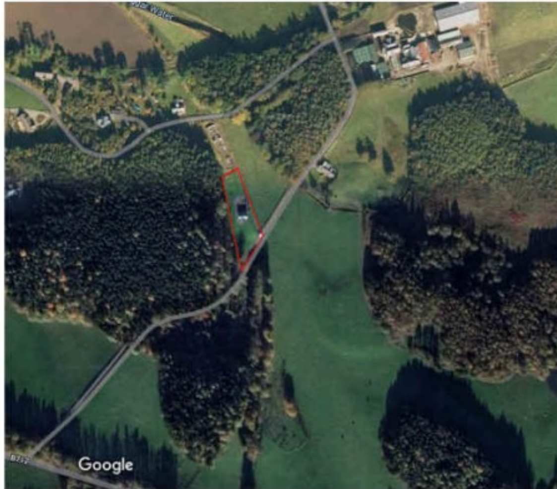
Fig 1: Location Map as provided by RM Architecture in Planning Statement, showing context of the site.